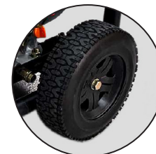
Heavy Duty Solid 10" Wheels