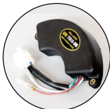
New AVR Regulation for Full Load Smooth Power Output