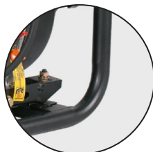
Heavy Duty 32mm Frame and Big Fuel Tank