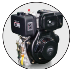
Kompak Diesel Engine Single Cylinder, Vertical,4-Stroke, Air-Cooled