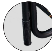
Folding Carry Handles