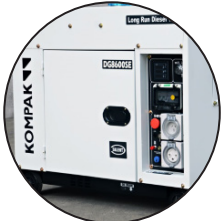
Soundproof and Rainproof Canopy Compact Design