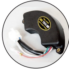
New AVR Regulation for Full Load Smooth Power Output