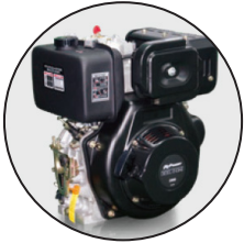
Kompak Diesel Engine Single Cylinder, Vertical, 4-Stroke, Air-Cooled