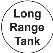
Fuel Tank Capacity 30 Litres